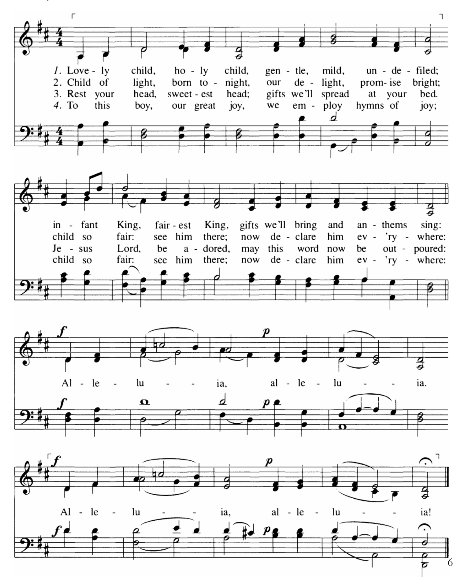
Hymn of Praise: Lovely Child, Holy Child